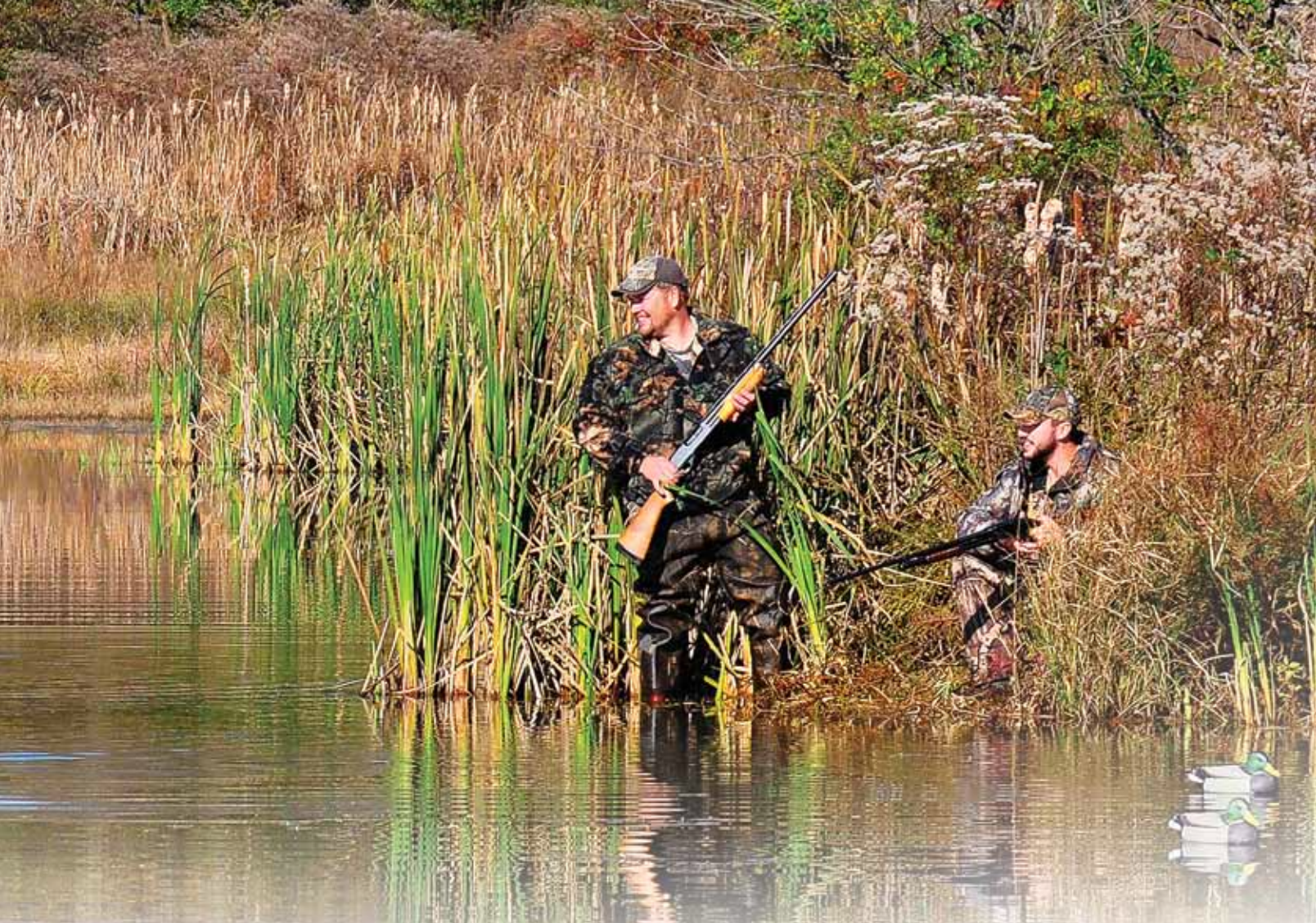
Happy hunters watch a retriever bring back the harvest.