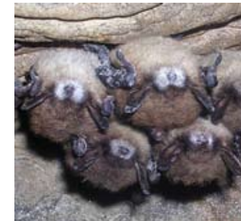
Hibernating Indiana bats in New York infected with White-nose Syndrome.

White-nose Syndrome is named for the white fungus which is often observed on the muzzles, wings and ears of affected bats. Although there may be several factors contributing to the condition known as White-nose Syndrome, the invasion of skin cells by a specific fungus is a consistent observation in all cases. The fungus, a member of the genus Geomyces , was cultured from the West Virginia bats. Genetic data indicate the fungus is identical to that cultured for other WNS-positive bats. Microscopic examination of the bats' skin provided evidence that the fungi had invaded the cells of the skin in all three species submitted: little brown bats, eastern pipistrelles, and northern long-eared bats.