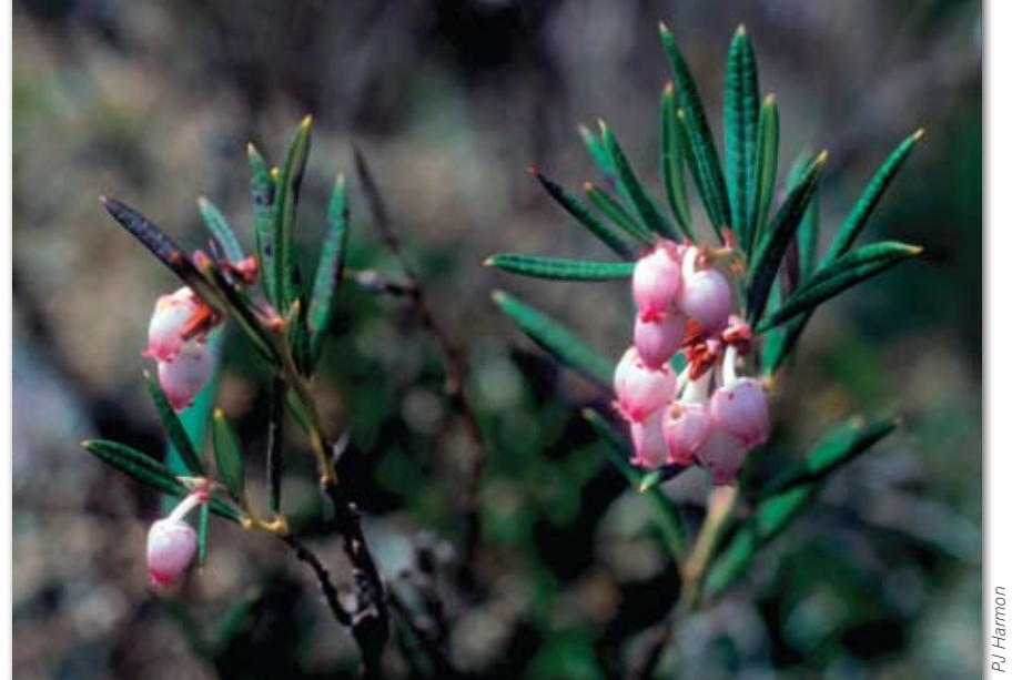
Bog rosemary is found in West Virginia only in Cranberry Glades.