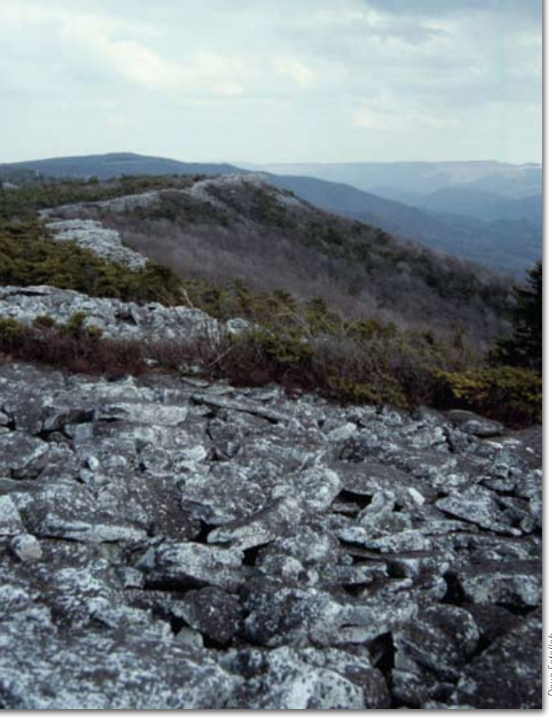
Strong west winds may have blown seeds of false heather to start an isolated population atop North Fork Mountain.