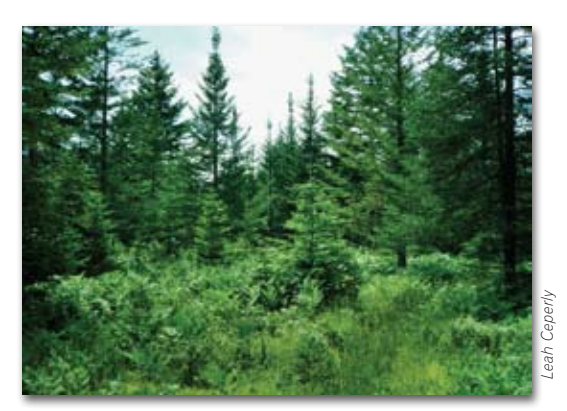
Balsam fir trees may have been pushed south from Canada by the advance of glaciers.

Appalachians to Blister Run Swamp in Randolph County, West Virginia. Both larch and balsam fir were once very abundant in the Ohio Valley, based upon the amount of their pollen seen in layers of peat that date back to the time the last ice sheet withdrew. Current Appalachian populations of these conifers may have established during a glacial period; or they might be even more ancient.