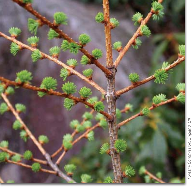
American larch, also known as tamarack.