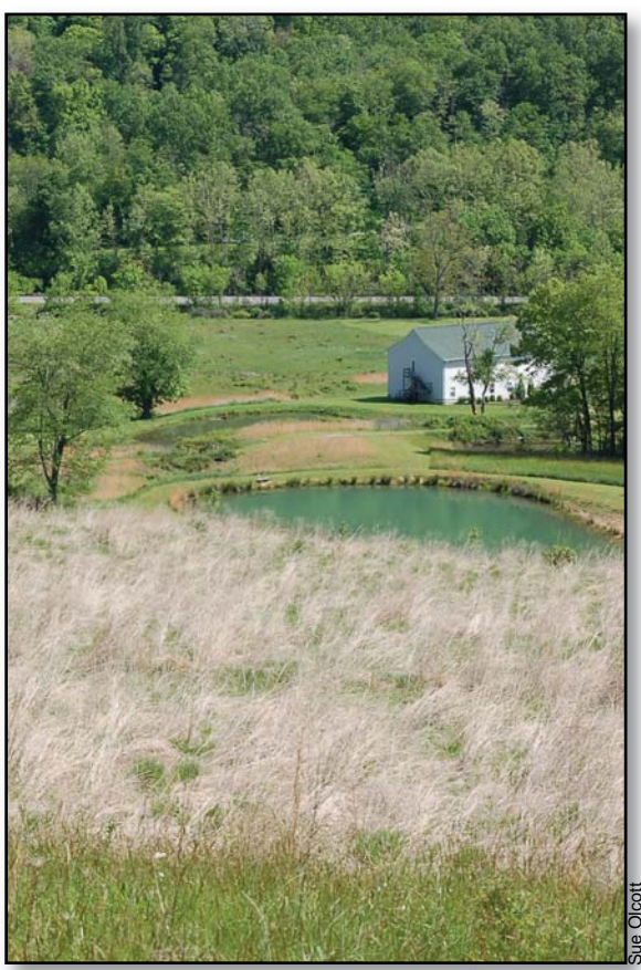
Warm season grasses attract various species of birds and wildlife that prefer open fields.

The gently sloping Green Trail and its many hedgerows provide good habitat for typical farm wildlife such as cottontail rabbits, mourning doves, red foxes and woodchucks. The hedgerows also support common songbirds throughout the year such as the northern cardinal, tufted titmouse, American robin and gray catbird. In the summer, the open fields of the Green Trail fill with eastern blue-