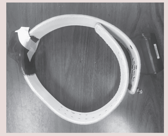
Top left: plastic ear tag Bottom left: metal ear tag Above: tracking collar