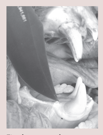
First lower premolar

In order for the tooth to be used for aging purposes, it must be unbroken. If you break a tooth trying to remove it from the jaw, there are three others that can be submitted. Hunters are encouraged to remove two or more teeth from their bear in the event that a tooth is lost in the mail. The skull of your bear will not be used in any mount (half mount, full mount, rug) that you have made and removing these teeth will not damage the skull itself.