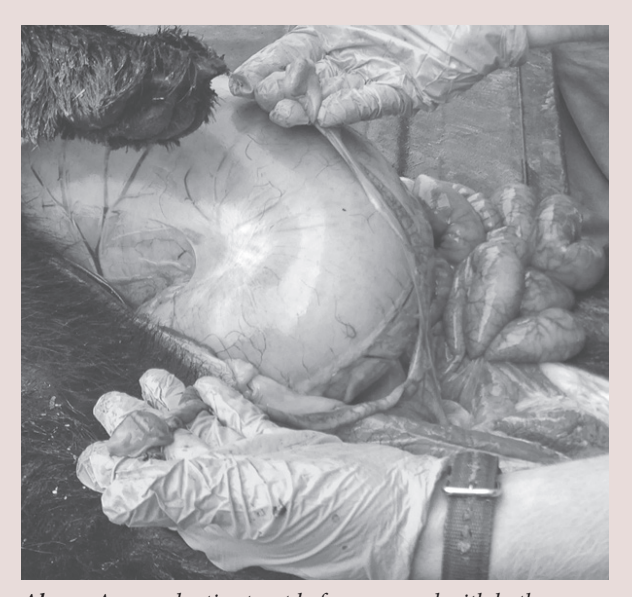
Above: A reproductive tract before removal with both ovaries and a complete uterus. Below: A complete reproductive tract with both ovaries and a complete uterus.