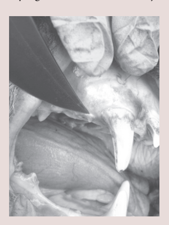
First upper premolar

The tip of the black knife blade in the photographs is pointing to two of the first premolar teeth. The photo on the left shows the first upper premolar (one on each side of the jaw). The photo on the right shows the first lower premolar (one on each side of the jaw). The tooth is very small and can be easily broken when trying to remove it from the jaw.