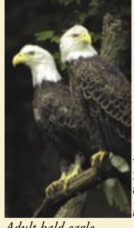
linings. The talons and bill are yellow.

Immature: The tail. head and body feathers are mottled brown with some white in the wing