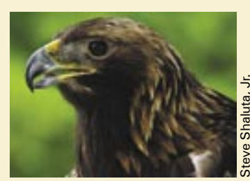
Adult golden eagle showing golden feather tips.

tips of the head and neck, and a slight lightening at the base of the tail. Their cere (the swollen area about the nostrils above the beak) and feet are yellow. Look for legs feathered