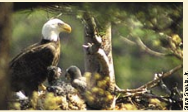
Adult bald eagle at nest with fledglings.

Incubation of the two or three eggs lasts about 35 days. After the eggs hatch, both parents feed the nestlings. One guards the nest while the other hunts. At around 10 to 13 weeks of age the eaglets, weighing nine to 12 pounds, leave