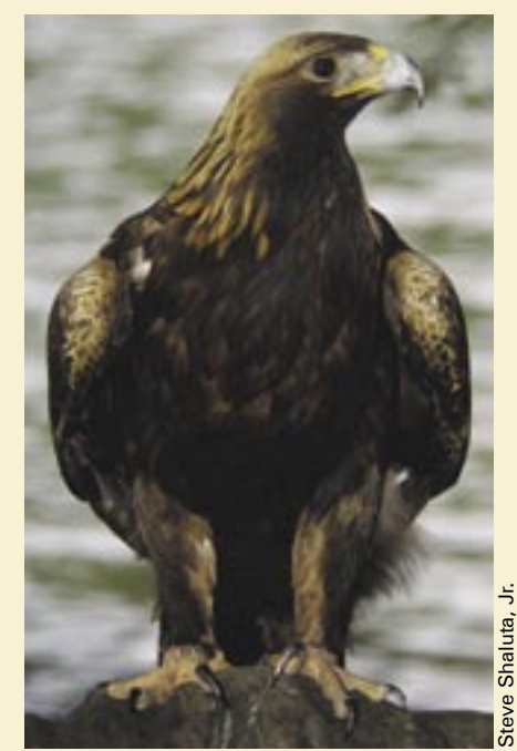
Adult golden eagle

Incubation of the one to four eggs is mainly a task of the female. Incubation lasts from