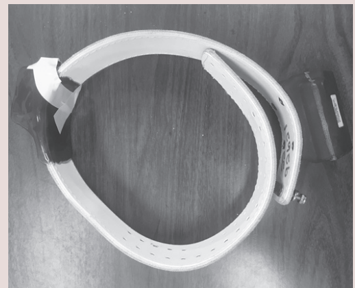
Top left: plastic ear tag Bottom left: metal ear tag Above: tracking collar