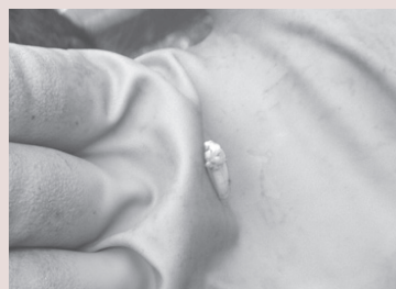
First premolar tooth after extraction showing a complete unbroken tooth with root intact.

In order for the tooth to be used for aging purposes, it must be unbroken. If you break a tooth trying to remove it from the jaw, there are three others that can be submitted. Hunters are encouraged to remove two or more teeth from their bear in the event that a tooth is lost in the mail. The skull of your bear will not be used in any mount (half mount, full mount, rug) that you have made and removing these teeth will not damage the skull itself.