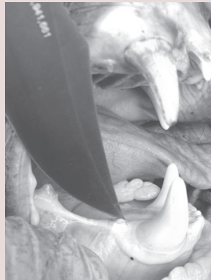
First lower premolar

In order for the tooth to be used for aging purposes, it must be unbroken. If you break a tooth trying to remove it from the jaw, there are three others that can be submitted. Hunters are encouraged to remove two or more teeth from their bear in the event that a tooth is lost in the mail. The skull of your bear will not be used in any mount (half mount, full mount, rug) that you have made and removing these teeth will not damage the skull itself.