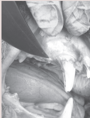
First upper premolar

The tip of the black knife blade in the photographs is pointing to two of the first premolar teeth. The photo on the left shows the first upper premolar (one on each side of the jaw). The photo on the right shows the first lower premolar (one on each side of the jaw). The tooth is very small and can be easily broken when trying to remove it from the jaw.